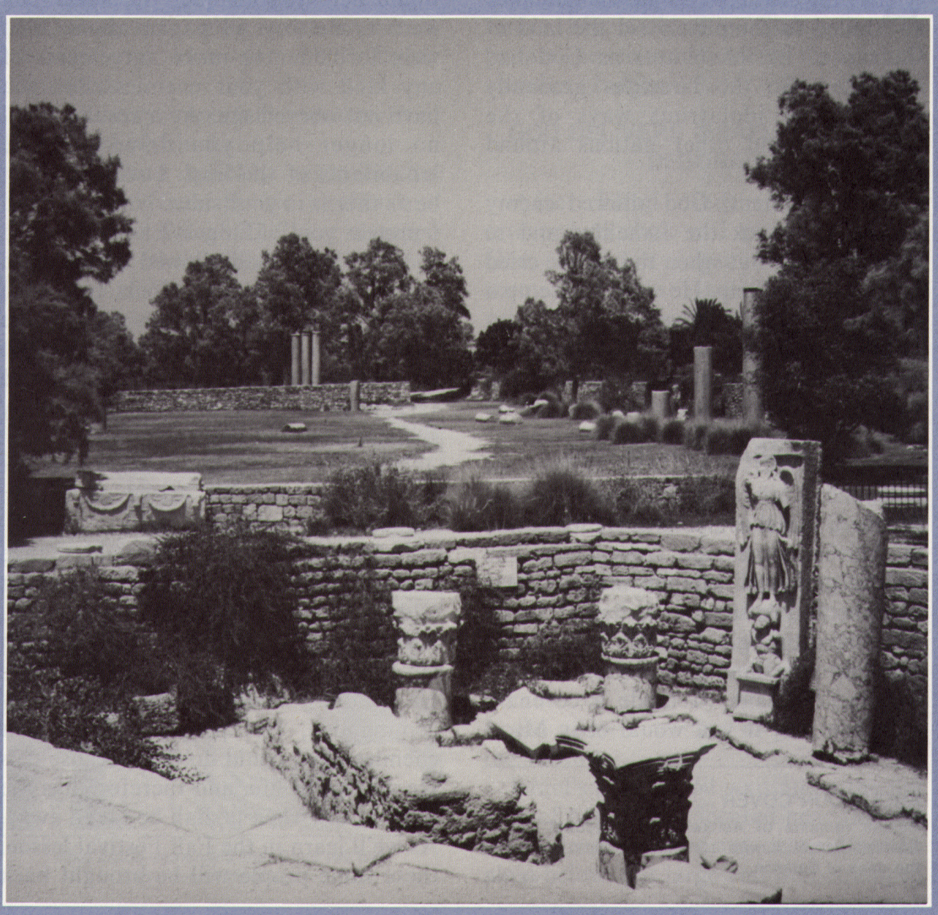
Israel During the Time of the Judges