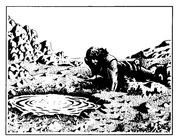
God caused a spring of cool, clear water to bubble up, thus saving Samson's life.

But Samson outfoxed them by leaving the inn at midnight. When he reached the main gates of the city, he discovered they were locked and barred.