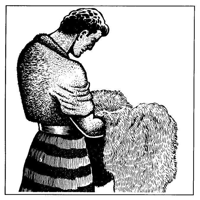
Gideon holds the fleece that proved God had chosen him to lead Israel against the Midianites.

But Gideon wanted another sign. "I will lay the fleece out again tonight,"